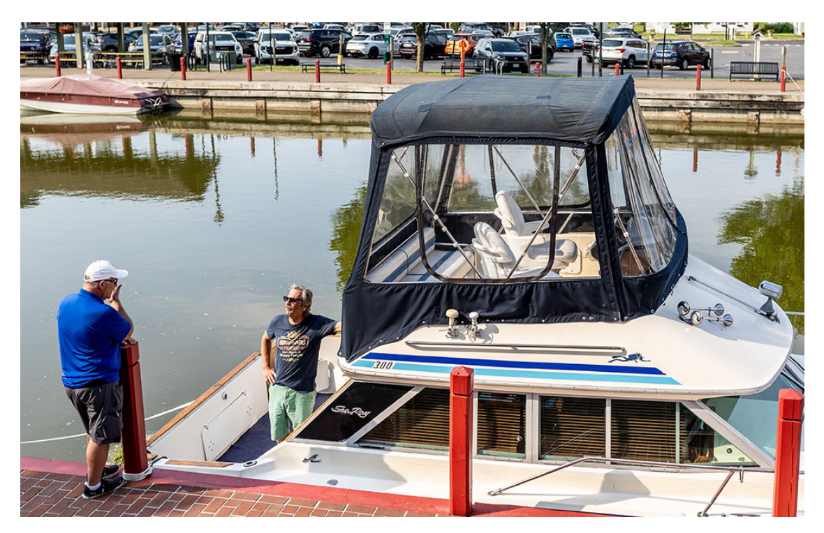
Enjoy your Fairport summer!