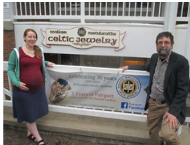
Walker Metalsmiths celebrates five years at their Fairport, NY Celtic jewelry store at 140 Packets Landing.