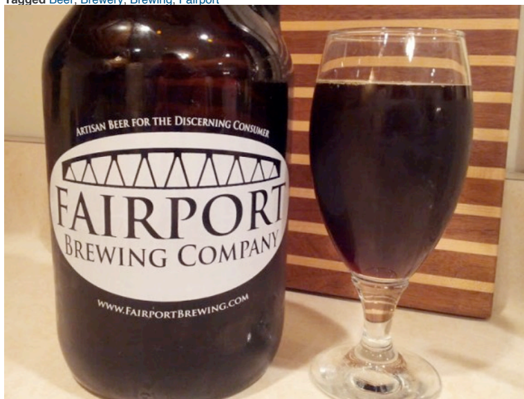
Fairport Brewing Company - Trail Town Brown

Posted by Matthew Van Ooyen • December 12, 2012 • 9:50 pm View 1 comment Tagged Beer , Brewery , Brewing , Fairport